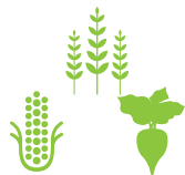
extraction of sugars from feedstock

The ethanol production process includes several steps, of which the most important are: